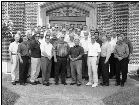
New Directors' Institute - Class of 2007/08

Each participant will be assigned a faculty member advisor and will work closely with a (deacon director) mentor for the duration of the Institute session which ends in April 2008. Each of the participants will complete a self-defined project during this period, results of which will be submitted prior to the April event. The project suggested to participants was the revision of their diocesan deacon formation manuals to be compliant with the National Directory.